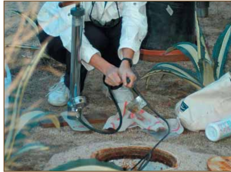
A volunteer gets her hands dirty testing an urban stormwater supply area.

This water augmentation study grew out of the Los Angeles and San Gabriel Rivers Watershed Council's vision for their watersheds within the next generation (20-30 years). The vision statement includes a principal goal of "using all water resources efficiently," including increased use of reclaimed water, groundwater recharge, and detention of stormwater. When the vision is realized, the Los Angeles region, while still dependent on imported water, will be able to provide a far greater proportion of its own water needs.