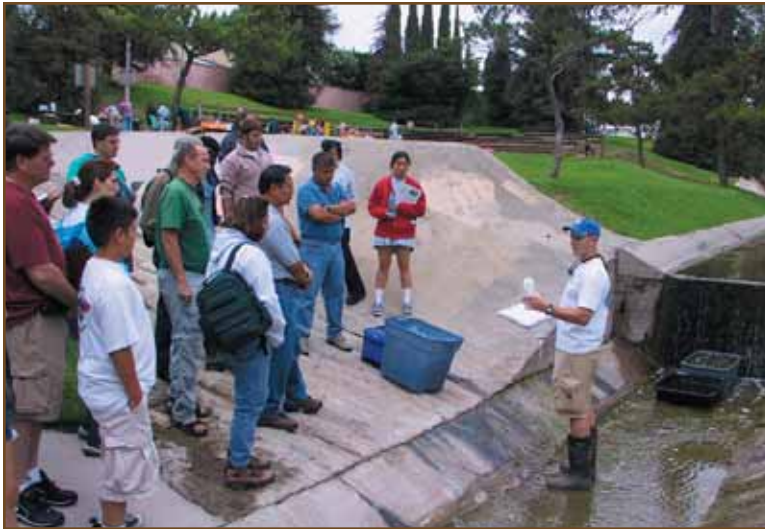
Local citizens participate in the Volunteer Water Quality Sampling Event on the San Gabriel River.