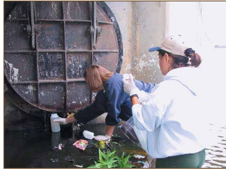
Volunteers monitor water quality in the San Gabriel River.

This project supports the Watershed Council to expand activities and to transition from volunteer staff to paid professional staff. The Watershed Council is expanding long-term partnerships with various communities in the watershed to promote improved watershed management. Their work results in more efficient use of water and reduction of contamination of groundwater resources.