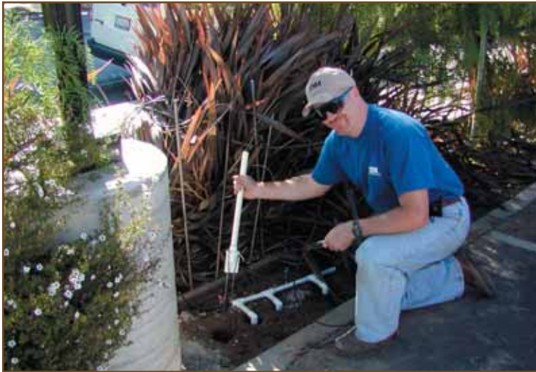
A worker implements the CALFED-funded Water Augmentation Study.