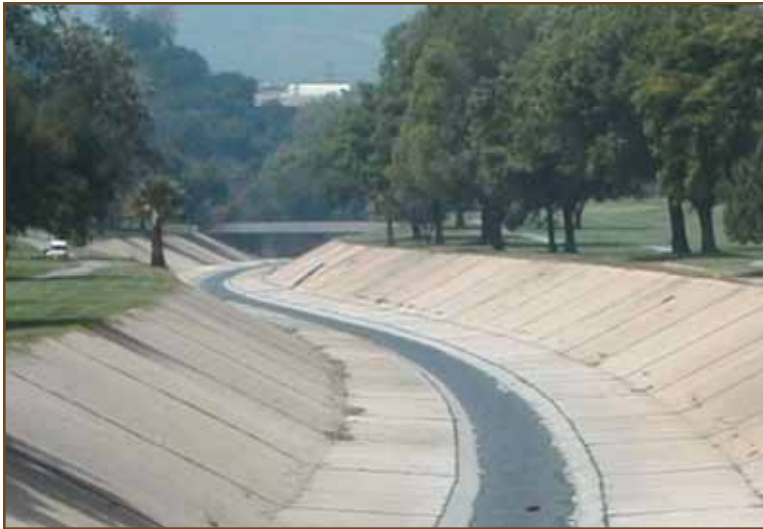
A view of the Arroyo Seco project area.