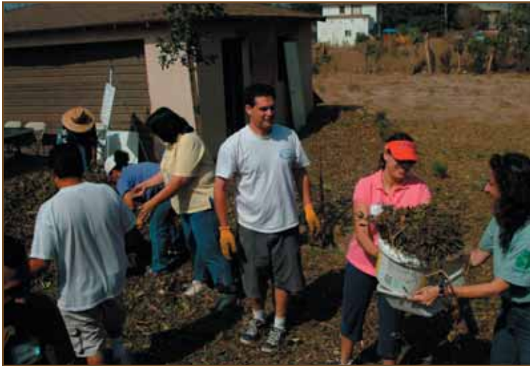
Home Forester workshop teaches Sun Valley residents hands-on landscaping techniques that will conserve water and reduce stormwater runoff.