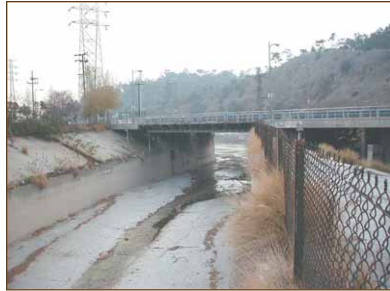
A dry water channel in the Arroyo Seco Watershed.

This project involves collaboration and support from diverse communities in the watershed to develop a Watershed Resources Plan. This plan integrates watershed management and education to inform citizens about groundwater conservation and protection of resources within the watershed. Outreach materials focus on increasing community water conservation and improving groundwater supply reliability. This project is also developing a citizen monitoring program to assess ecosystem improvements and water quality in the watershed. The long-term goal of the Arroyo Seco Watershed project is to implement projects that improve water conservation and water supply reliability, restore natural function to the Arroyo Seco River, and make other ecosystem improvements in the watershed.