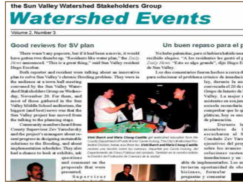
Sun Valley residents are kept apprised of watershed news and project developments through public meetings and newsletters.

The Sun Valley Watershed is a 2,800-acre urban watershed tributary to the Los Angeles River, located northwest of downtown Los Angeles. The watershed includes the community of Sun Valley and portions of North Hollywood. The community is subject to chronic flooding conditions that have been present in the watershed for more than 30 years. Traditionally, flood control agencies like the Department have addressed these types of flooding conditions by constructing single purpose storm drains, which carry rainfall, a valuable resource, straight to the ocean. In the past, such a solution was proposed to address the flooding conditions in the watershed at an estimated construction cost of $40 to $45 million. In lieu of constructing storm drains, this pilot project implements the following structural BMPs to reduce flooding and capture rainfall in the watershed: dry wells, enhancement of rainfall absorption into the soil through mulching, multi-use of rainfall retention basins, pavement removal in areas such as schoolyards and parking lots, porous pavement, shallow grassy on-site retention systems (swales, basins, etc.), tree planting, underground municipal rainfall storage facilities, and underground residential cisterns.