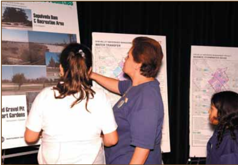
Community residents view displays at a town hall meeting.